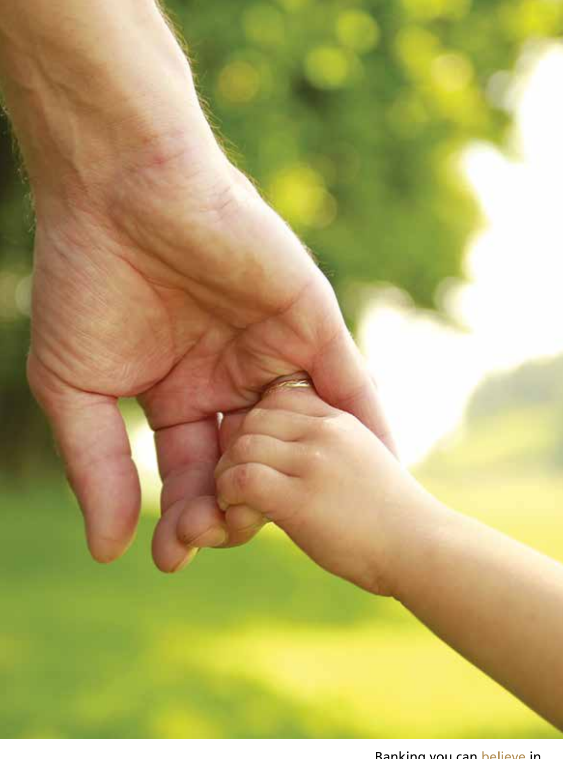
Banking you can believe in