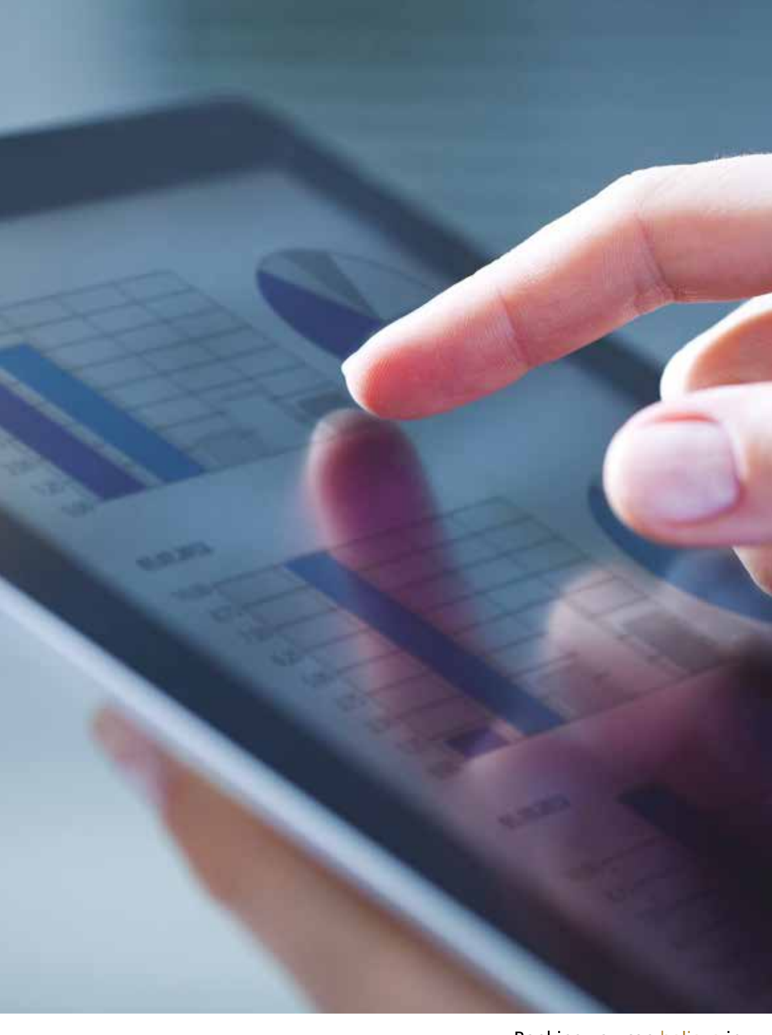
Banking you can believe in