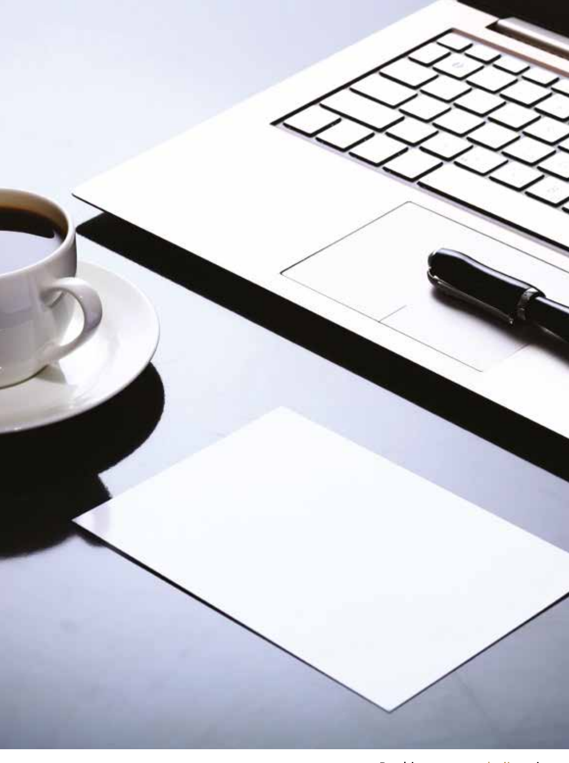
Banking you can believe in